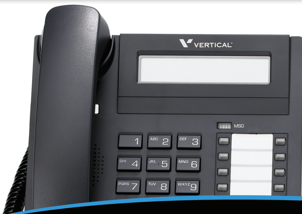
Edge 700 phone