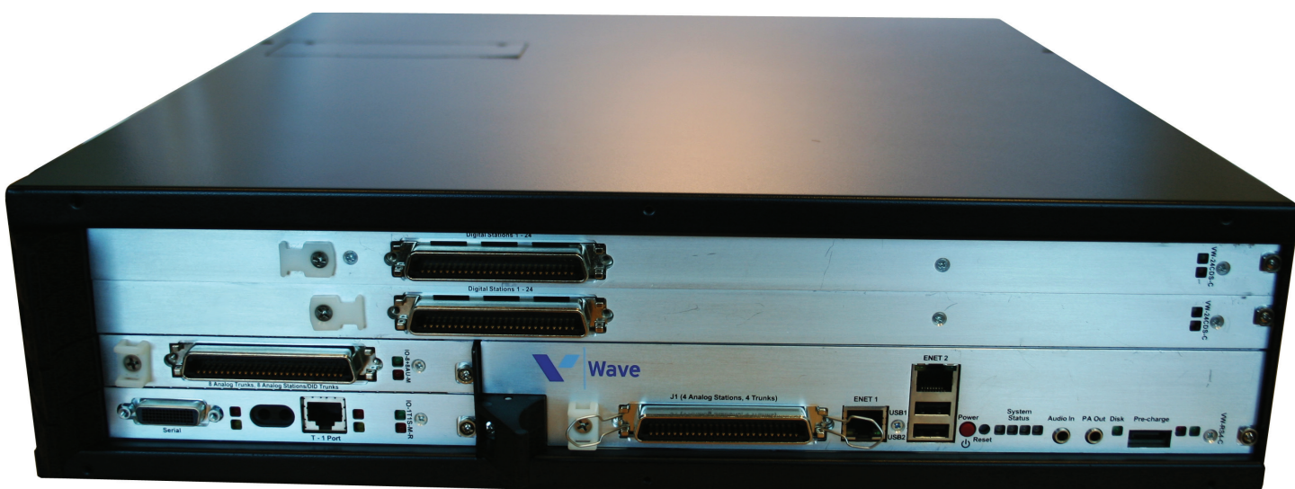
Wave IP 2500 system for HQ and medium offices, supporting up to 350 users.

Wave IP offers a robust Web-based administration console that can be accessed remotely and configured to provide alerts and alarms based on system status and performance. The Wave Global Administrator management console has over 50 applets covering configuration, user management, diagnostics, licensing and notification/alert management.