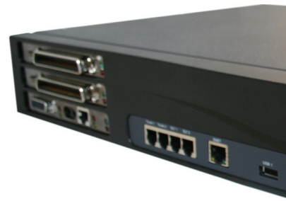
Wave IP 500 system for branch and small offices, supporting up to 50 users.

Unlike other solutions that offer support for adding voice applications at a later date, but which require additional servers and other components — not to mention long deployment schedules and business disruption — Wave IP is unique in its Applications Inside architecture. Wave's portfolio of embedded applications is included "in-the-box" with every Wave IP system. You choose what you need, when you need it.